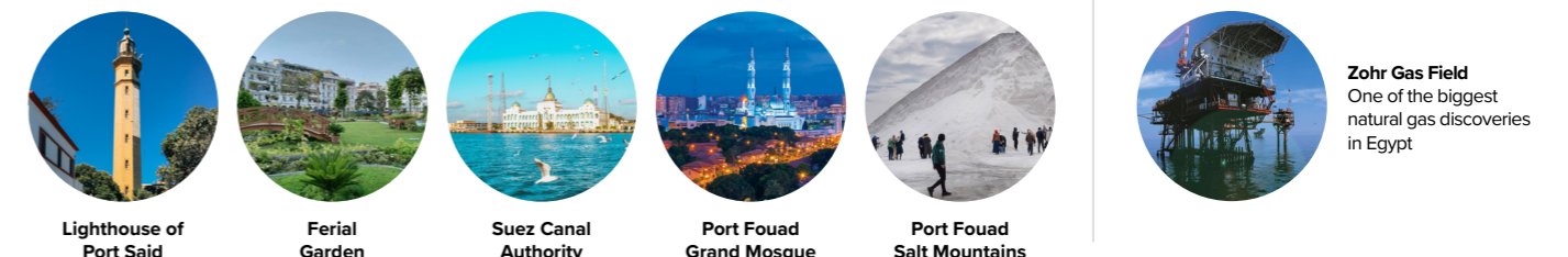
Lighthouse of Port Said